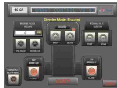
Diverter Mode permits two-handed operation on the touchscreen.