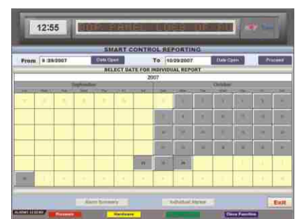
Alarm Log Calendar